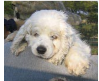
Looking over Dad's shoulder